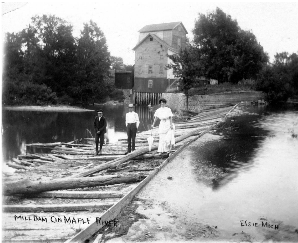
Craven Grist Mill

In 1836 the Craven family settled on the Maple River and built a saw mill. They platted out a village known as Craven's Mills about \frac{3}{4} of a mile west of where Elsie is today and several stores were created.