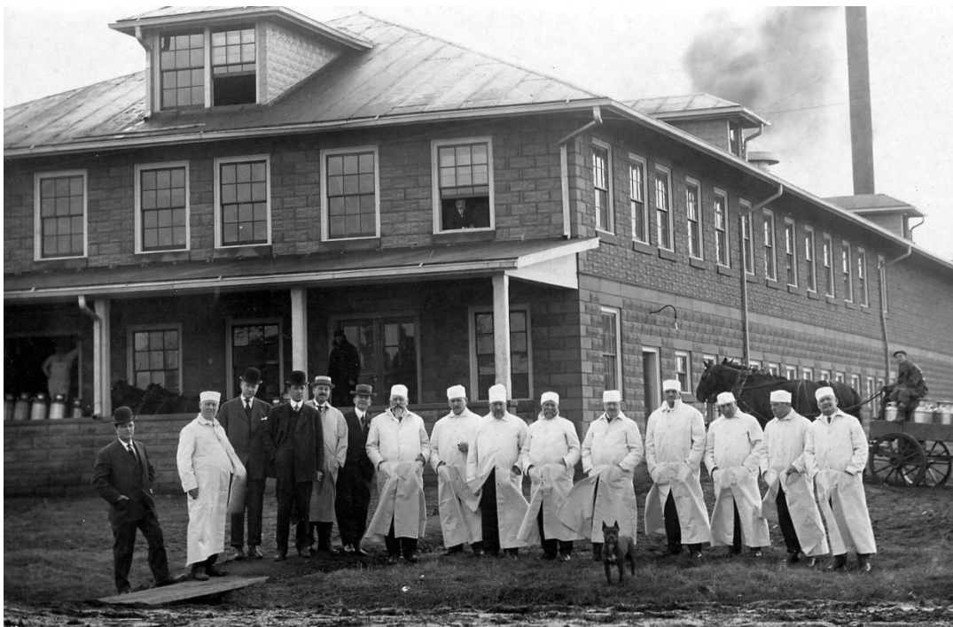
Eckenberg Milk Plant c1913