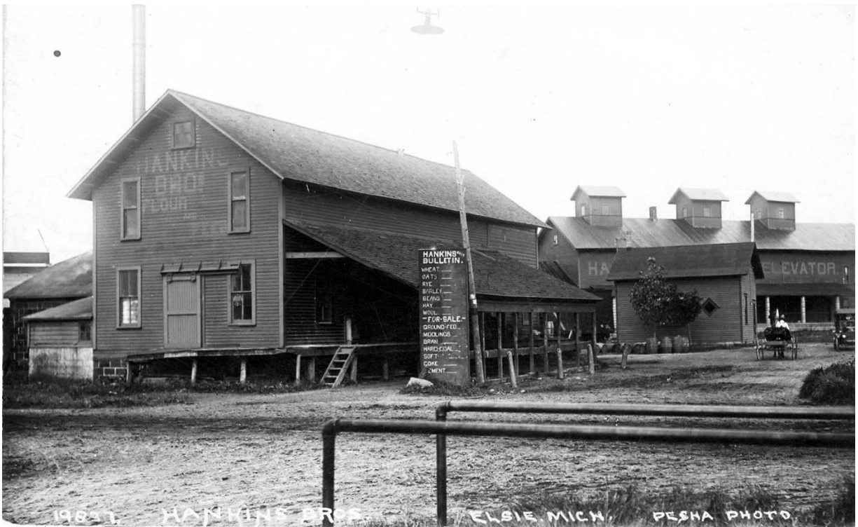
Hankins Brothers Elevator