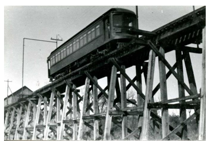
Interurban crossing the Looking Glass River at DeWitt

The first tracks were laid for the Lansing to St. Johns interurban train in May of 1901. By July the train was running between DeWitt and Lansing. On February 1, 1902, the first train reached St. Johns with stops every mile. The interurban was powered by overhead electric lines.