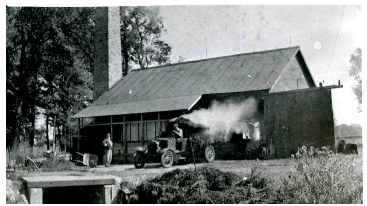
Crosby Mint Still

others were growing mint. The oil is removed from the mint plants in a still. More mint is grown here than anywhere else in Michigan. St. Johns has a Mint Festival every August.