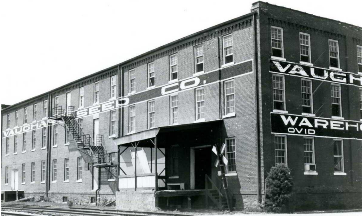
Vaughan Seed Company

After the Ovid Carriage Works closed, Vaughan Seed Company took over the building in 1913. Vaughan Seeds was famous for growing and selling gladiolus bulbs grown in the Ovid area. Beginning in 1939 a Gladiolus Festival was held in Ovid for several years.