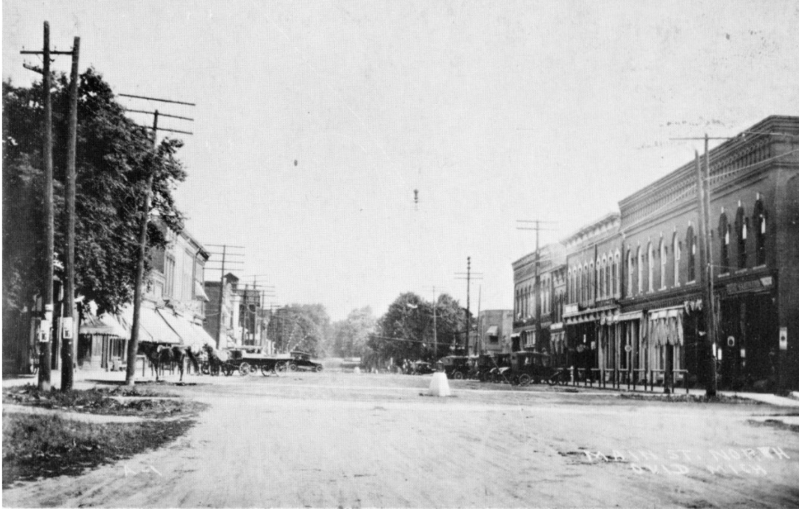
Ovid early 1900's

Milk and milk products have also been an important industry in Ovid. Ovid had an early cheese factory. The first dairy plant began in 1921 funded by author James Oliver Curwood. It was later sold to the Arctic Company and then Detroit Creamery Company.