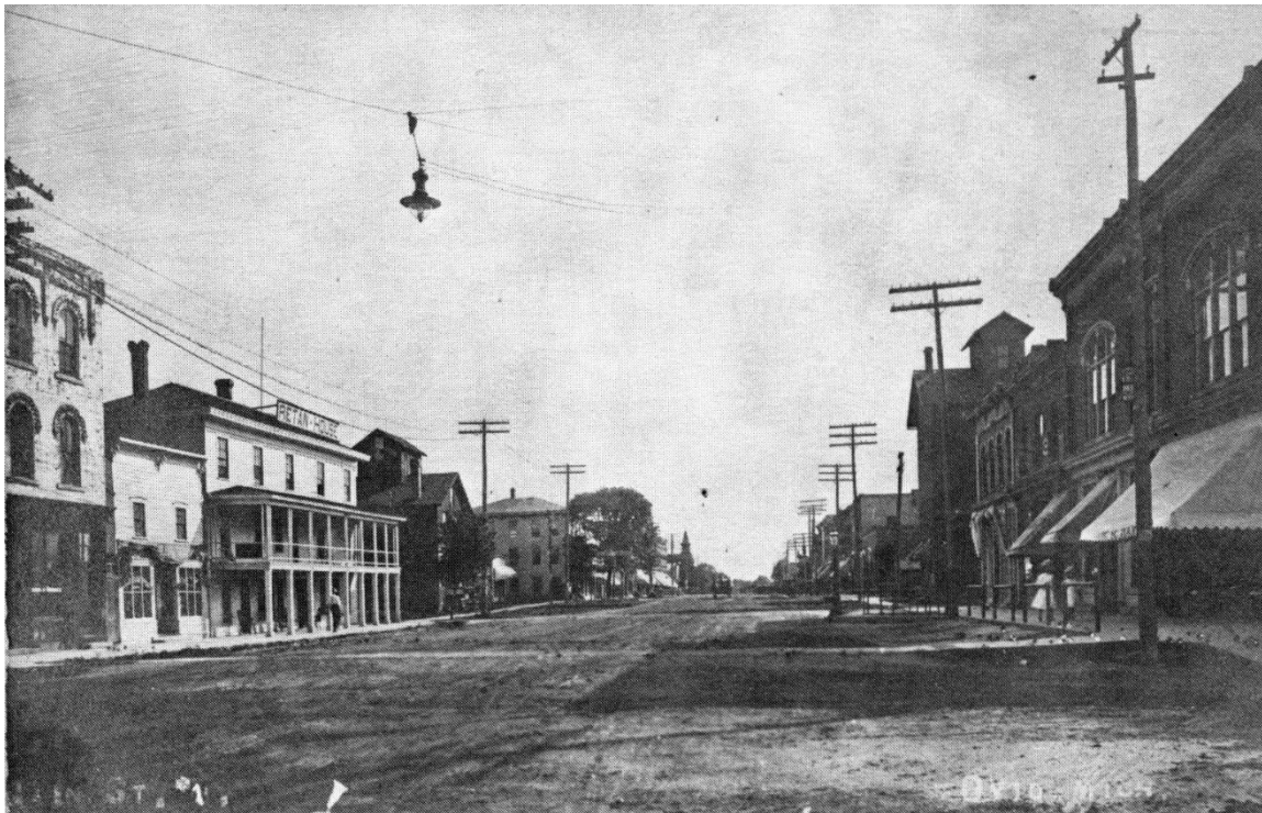
Ovid early 1900's