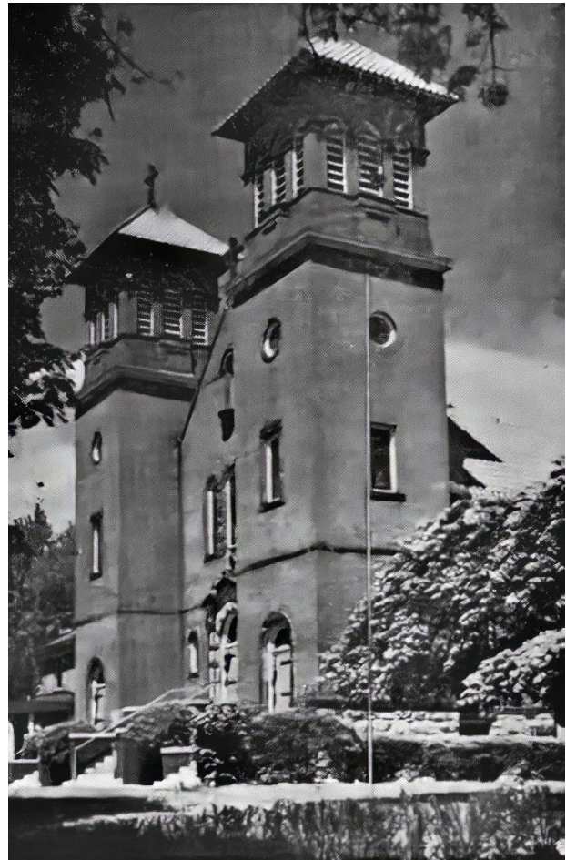
St. Joseph Church

Note: Railroad Street during the early days is now called Main Street. State Street was the original main street in Pewamo.