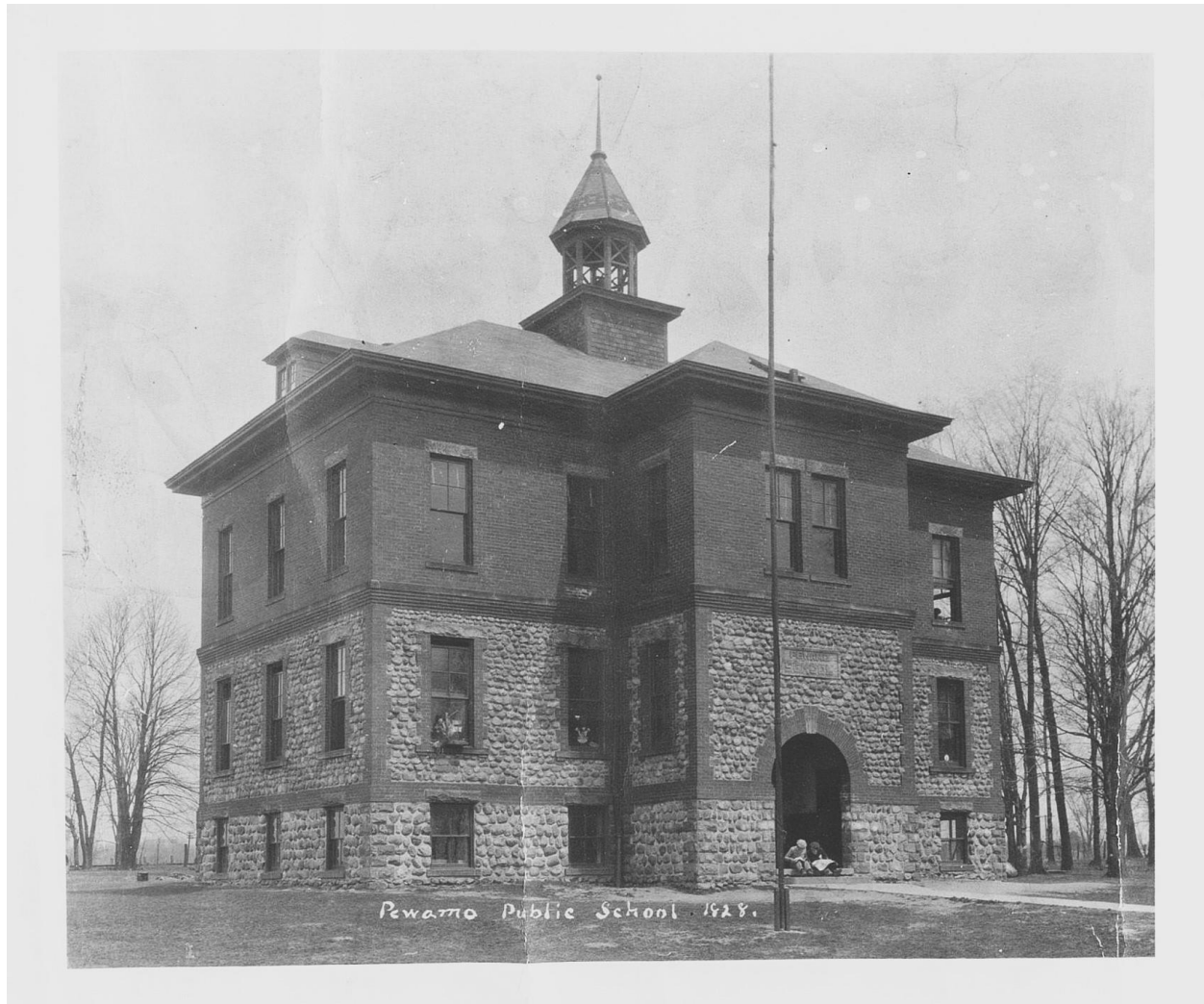
Pewamo School 1928

A public school was started in Pewamo shortly after the town's founding. By 1872 a brick school had been built on Jefferson Street on the westside of town. By the 1880's it had added high school classes. The first high school graduating class was 1888.