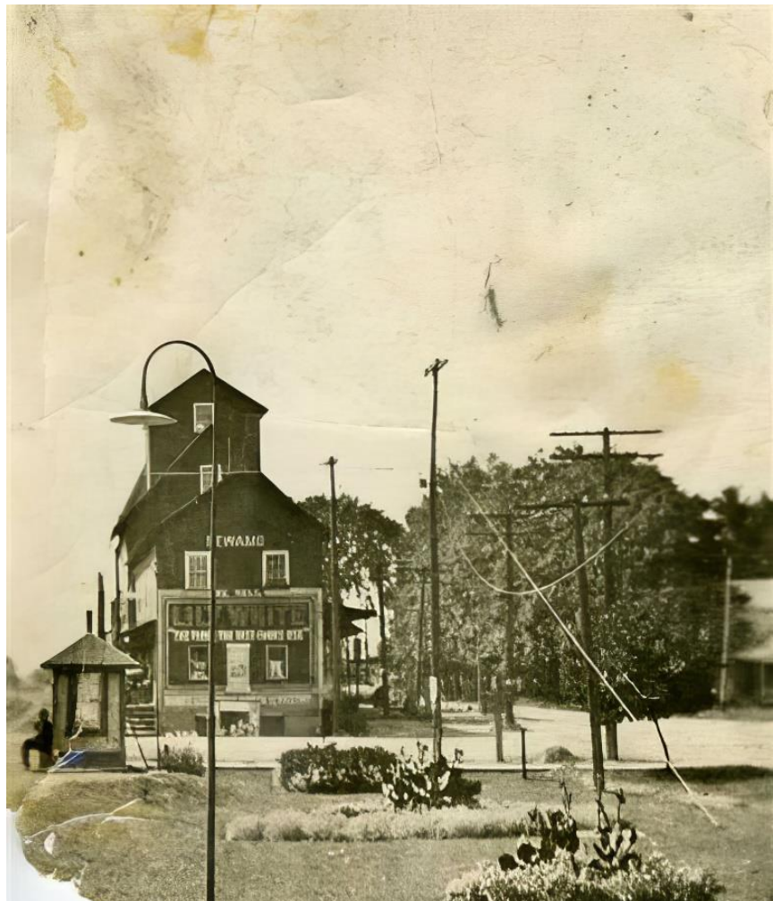
Pewamo Train Depot