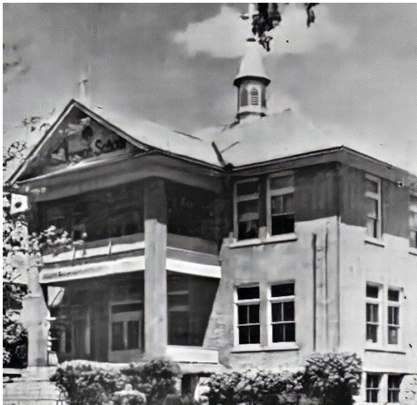
Old St. Joseph School

A convent was added in 1942 and the church enlarged in 1951.