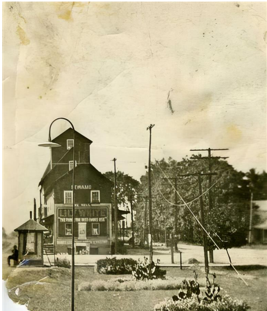
Pewamo Train Depot