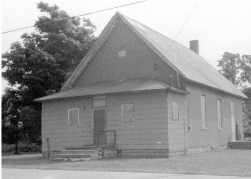
Shepardsville School Building 1991

The first Shepardsville school began shortly after its founding. The first building was replaced by the one below in 1895. This one was used until the mid-1960's when it joined Ovid. The building has since been used as a Methodist youth center, Amish school, and event hall.