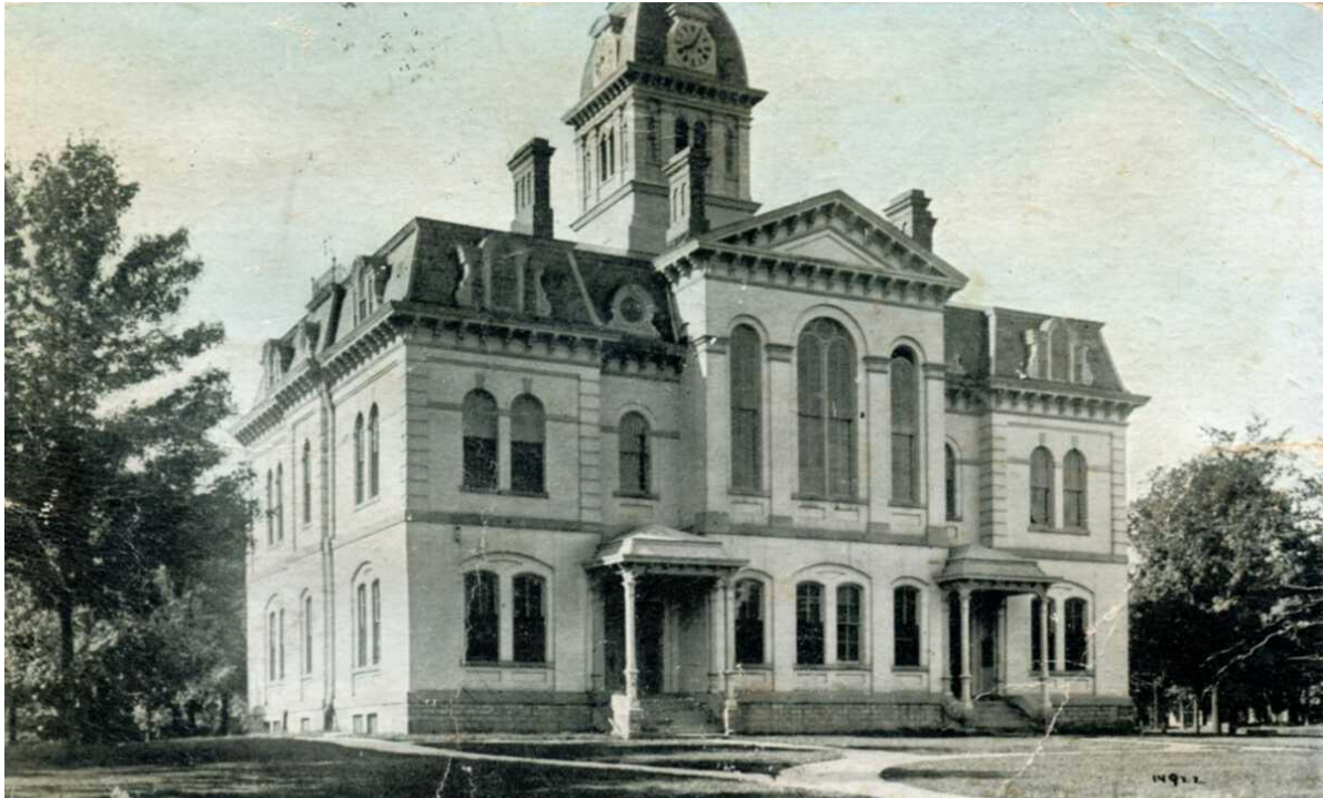
Clinton County Courthouse before additions

The first county offices were in Plumstead Hall on the northeast corner of Clinton Avenue and Walker Street. It was used until the first Clinton County Courthouse was opened in 1871. This courthouse was enlarged and later replaced by the current one in 1998.