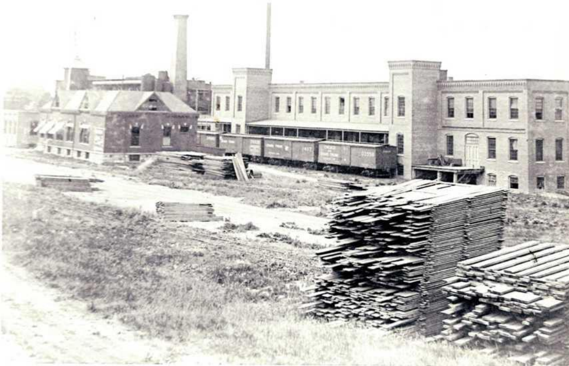
St. Johns Table Company

St. Johns also had many factories. They made wagons, trucks, tables, and wagon and car parts.