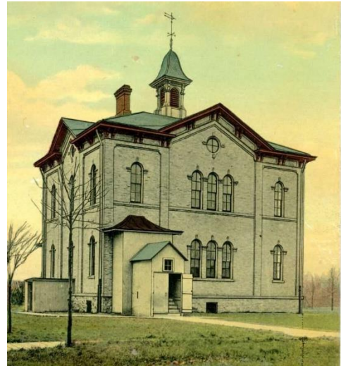
East Ward and North Ward Schools