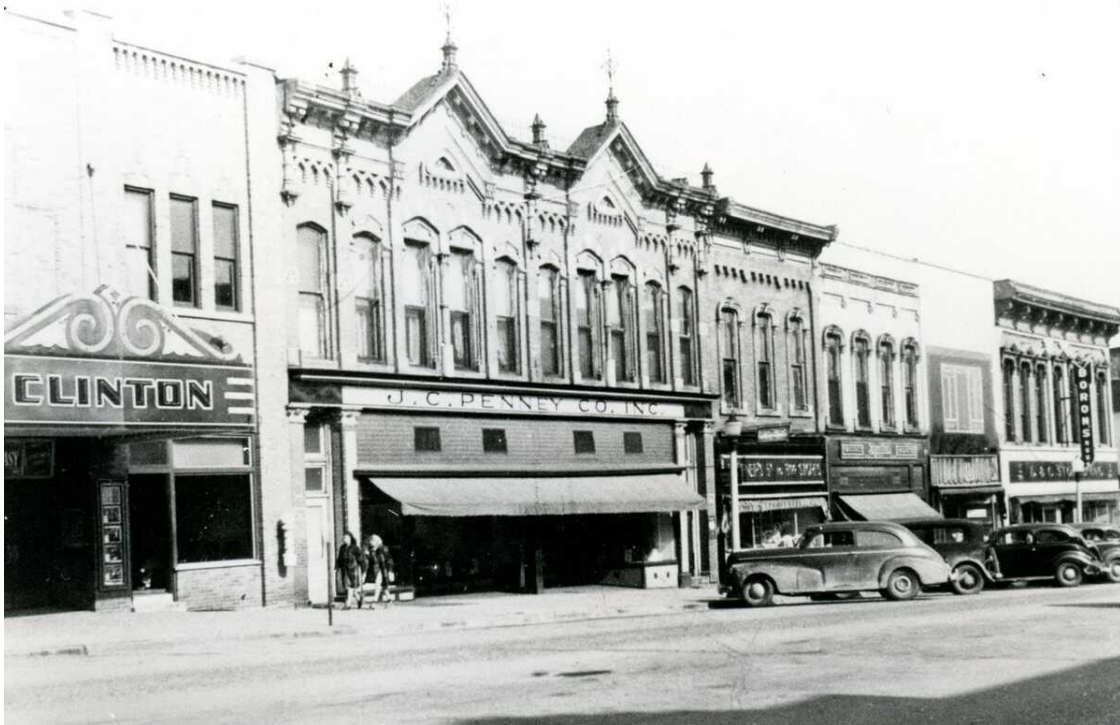
Clinton Avenue c1940 with Clinton Theater and J. C. Penney

The largest and most impressive hotel was the Steel Hotel. It opened in 1888 and was destroyed in a 1975 fire.