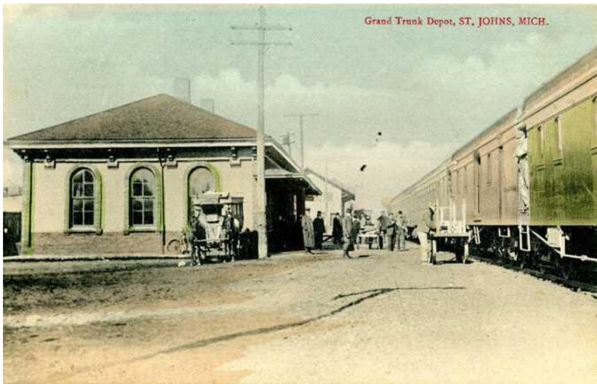
St. Johns Depot early 1900's

The railroad reached St. Johns on January 16, 1857. The first temporary depot was replaced in 1868 with a brick building. A tornado destroyed the depot in 1920 and it was replaced with the current building.