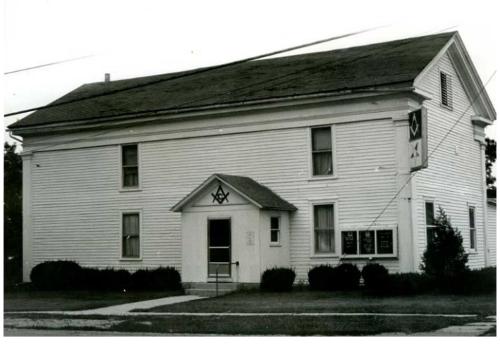
Wacousta-DeWitt Masonic Hall

By 1880 the town had two general stores, a grocery, a drug store, a sawmill, and a gristmill.