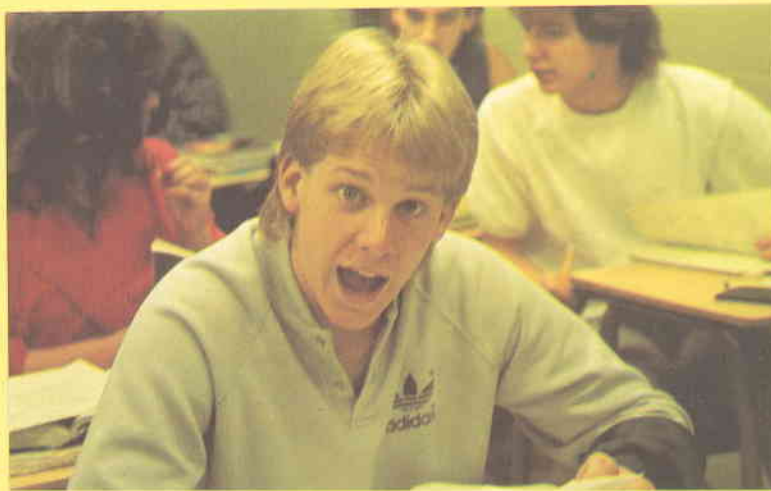
"Shout it out!"