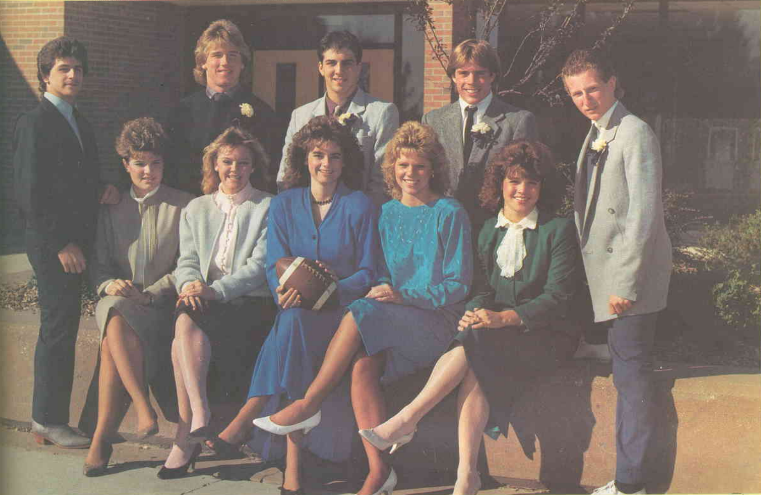
1986 FALL HOMECOMING COURT