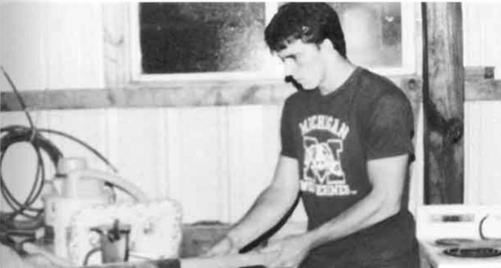
IF YOU WANT IT DONE RIGHT, LEAVE IT TO BILL.