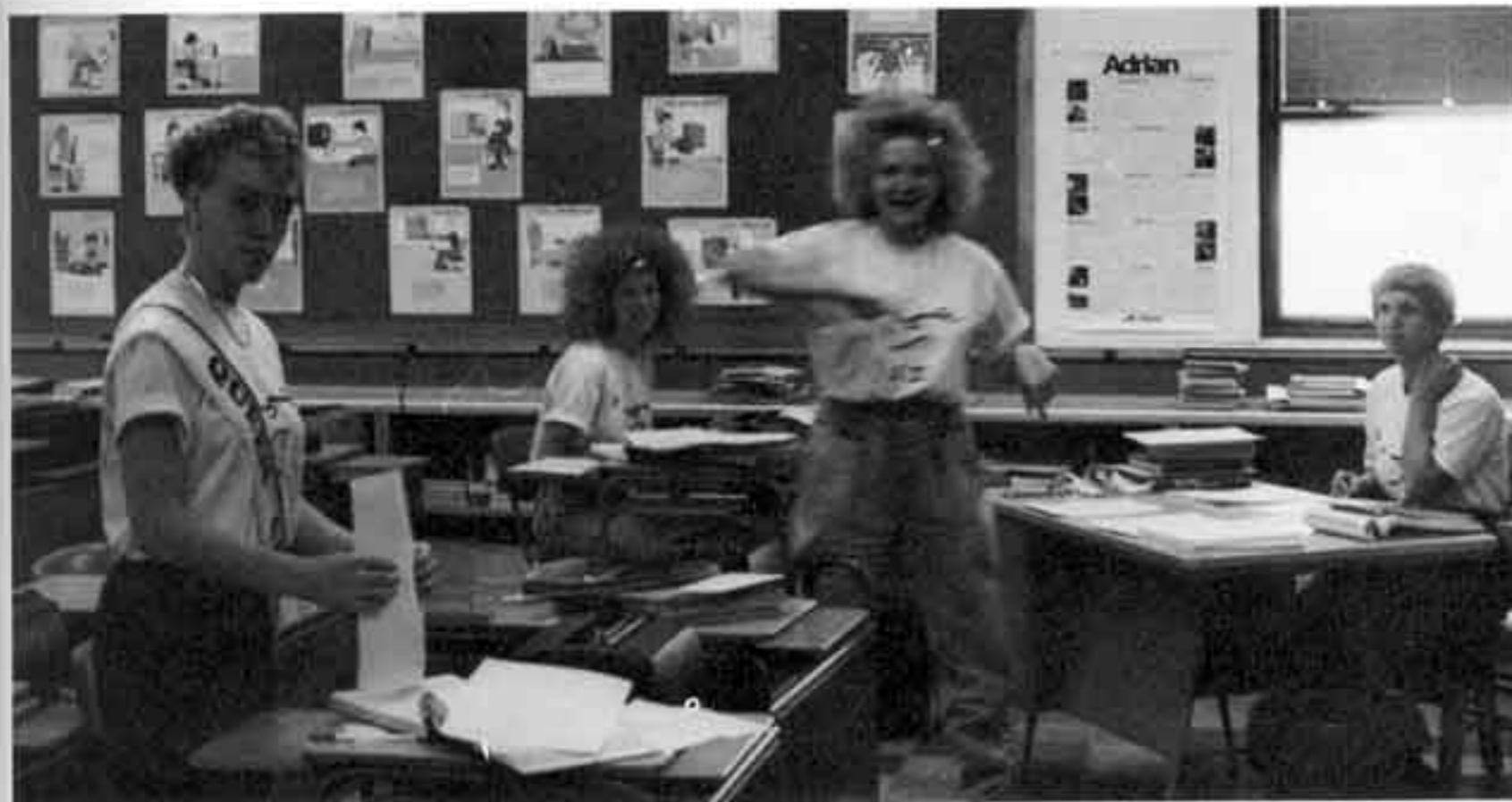
NO MRS. SMITH, IT CAN'T GET ANY WORSE.