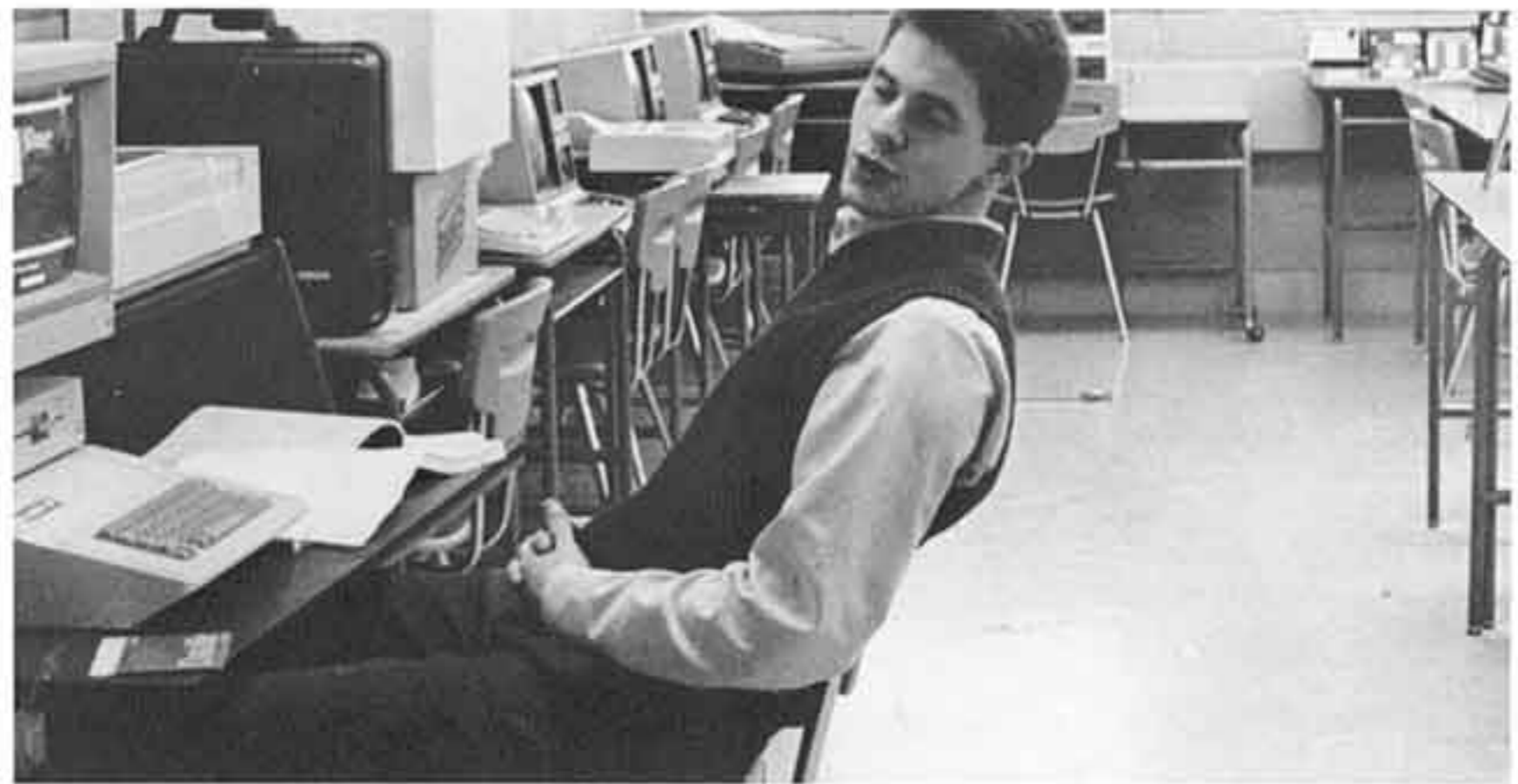
COME ON RUSS SAVE THAT FOR LATER