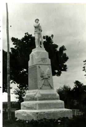
Mt Rest Civil War Statue

Donations of any size would be appreciated and may be sent to the Cemetery Office earmarked for the tree fund. The address is 706 E. Steel Street, St. Johns. If you have any questions you can email the cemetery at mtrestcemetery@gmail.com or call (989) 224-3160.