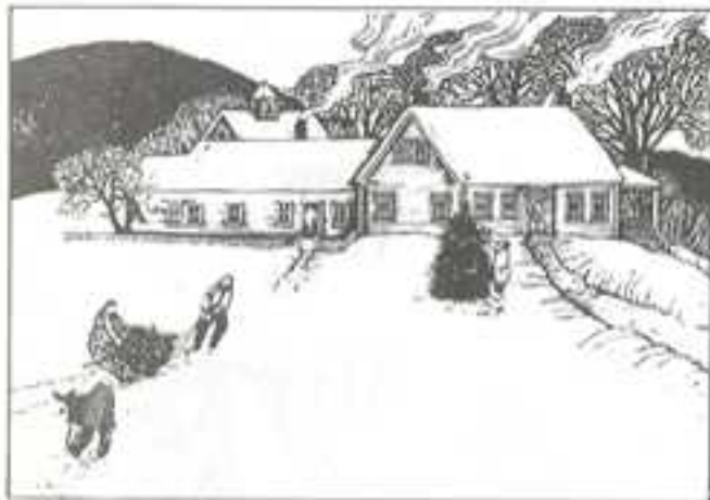
Bringing in the Tree