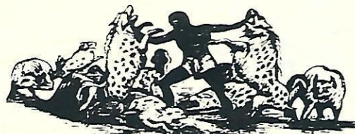
COMPOSING IN FULL.

Cooke's Royal English Circus and Queen's Popular California Circus, Emphatically the Largest, Best and Most Refined and Chaste Combination America can Produce. A Carefully Selected Troupe of 40 First-Class Circus Performers and the Three Best Bareback Riders in the World. Three of the Funniest Clowns Living.